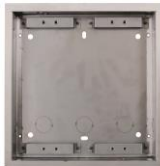
Helios in-wall housing UP for 2 modules In-wall housing for indoor installation