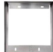
Helios weather protection frame for 2 modules Roof for outdoor installation