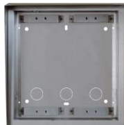
Helios in-wall housing with UP weather protection frame for 2 modules In-wall housing for indoor or outdoor installation